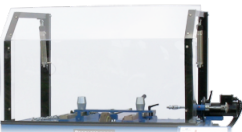
77580-01 Full Shield

79093-05 Ceramic Relief Stone will grind relief in half the time as a standard aluminum oxide stone.