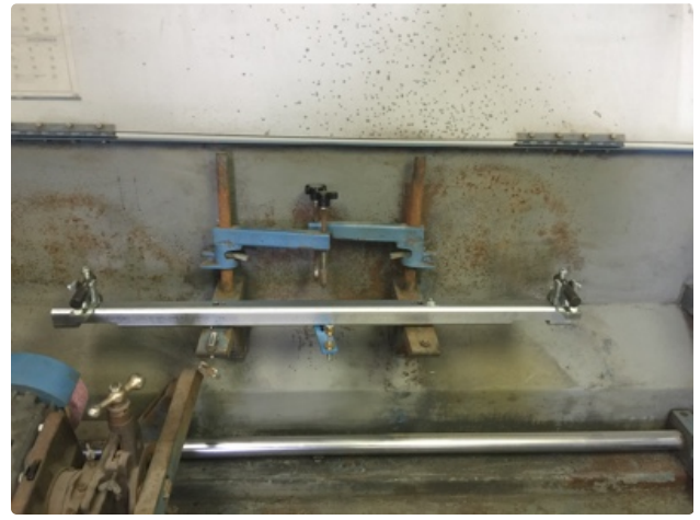
2. Place the bar on the bed knife supports and center the bar. The machined surfaces face to the back and up with the v-block extended off the front.

1. Tools needed: Roller shaft, electric drill, tape measure, mag base dial indicator with flat tip, tap handle, oil, 3/16 allen wrench, 9/16 wrench and socket, hammer. 60471-01 Install Kit which includes a 25/64 transfer punch, 5/16 drill. 3/8-16 tap. 15/64 drill. 249 reamer. H7 (251)