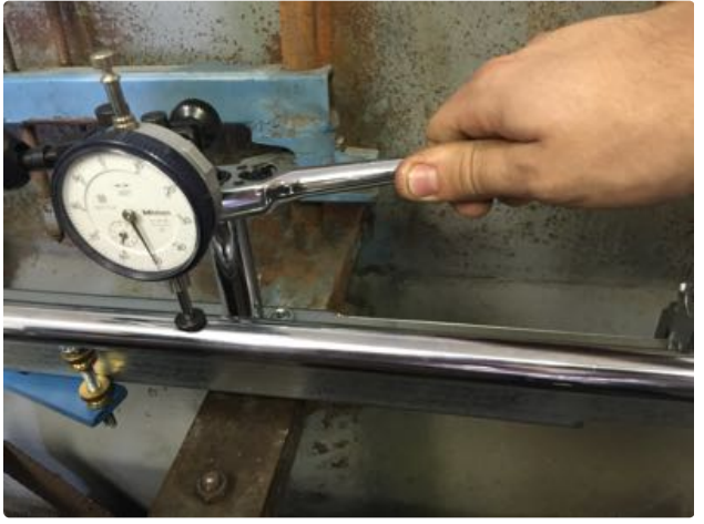
24. Loosen the bolt on the right end of the bar.