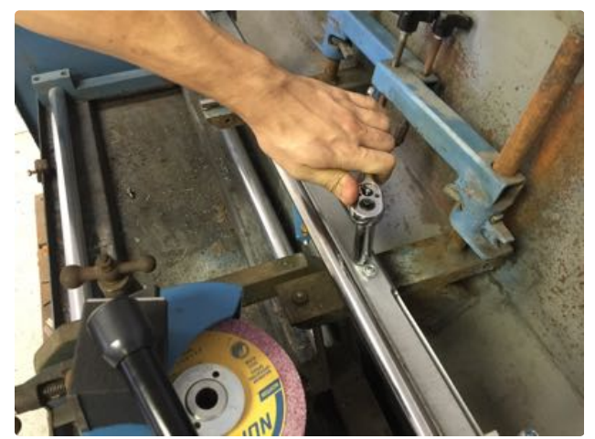
17. Loosen the bolt on that end of the bar until it is just snug.