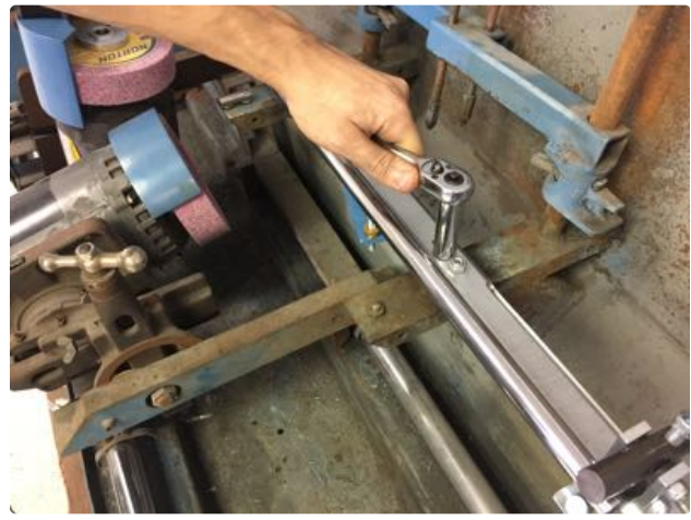
27. Tighten the bolts which hold the bar to the bed knife support, Then recheck both the top and front measurement to make sure they are within .003.