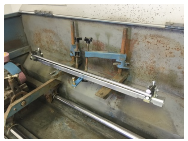
11. Place the roller shaft in the v supports