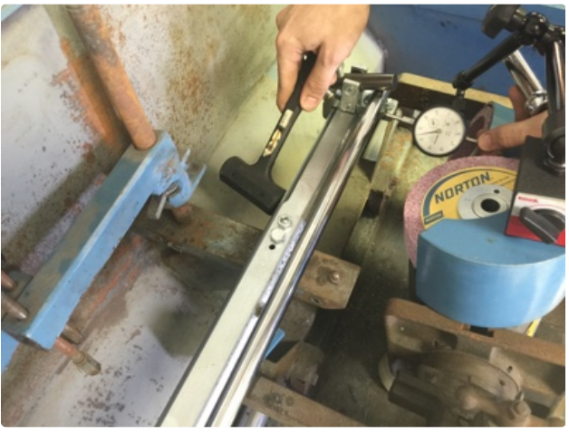
18. Tap the bar lightly on that end and move the bar half of the difference. If it reads .030, move the bar until it reads .015.