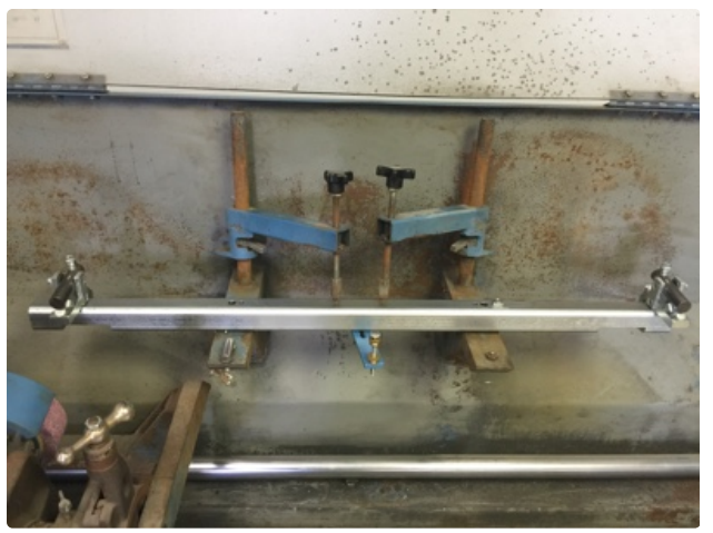
4. Clamp bar in place. Double check your measurements before drilling.