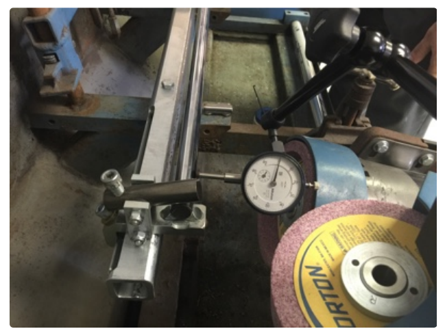
14. Set the dial indicator to zero.