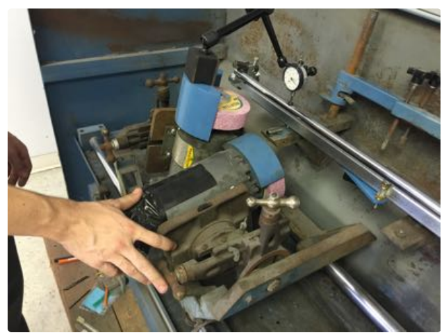
20. Reposition the dial indicator so that the tip of the indicator rests on top of the shaft.