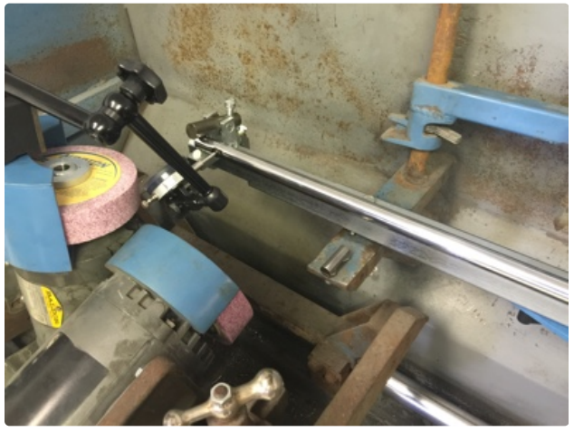
12. Place a dial indicator on a magnetic base on to a grinding head so that the tip of the indicator rests on the front of the shaft. Use a flat tip.