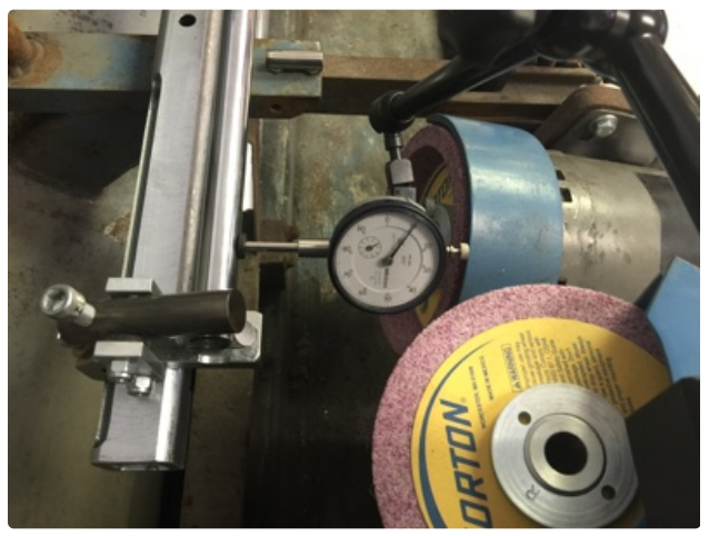
6. Place dial indicator on grinding head and position bar so that the ends are within .010 inches.