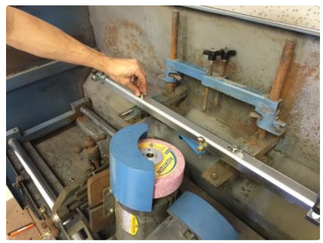
33. Remount the bar on to the bed knife support and double check its position.