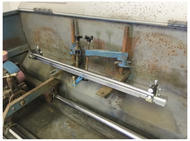
5. Place a shaft like a roller shaft in the v supports so that the v supports are equally spaced from the ends.