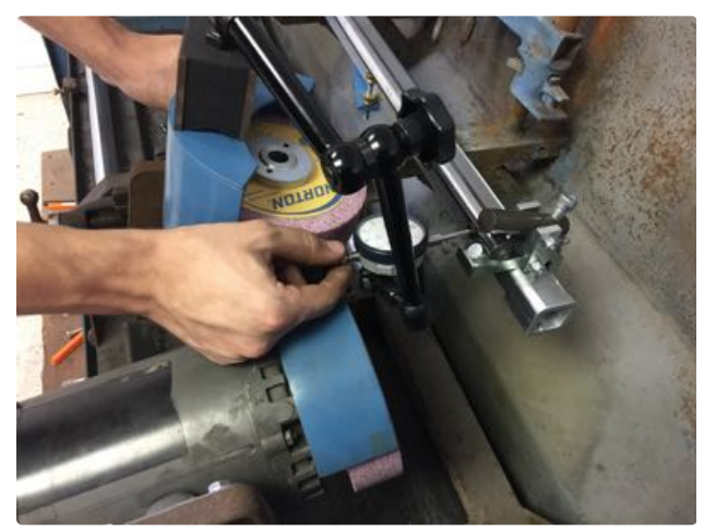
15. Pull back the dial indicator stem and move the grinding head to the other end of the roller shaft, just inside the v-support.