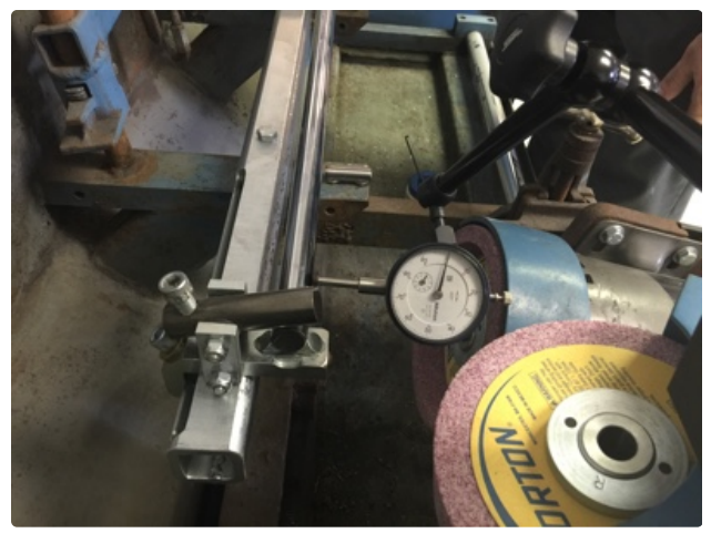
19. Move the grinding head back to the first end and repeat steps 13 through 17 until the difference is less than .003.