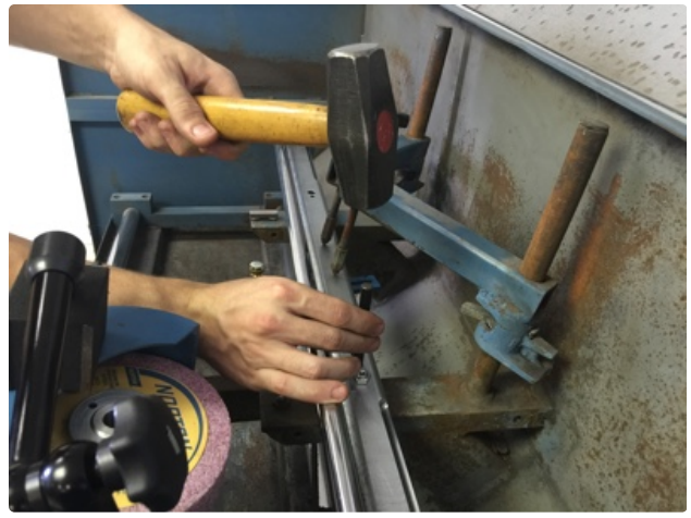
7. Transfer punch and center punch the hole location of the two large holes in the bar.