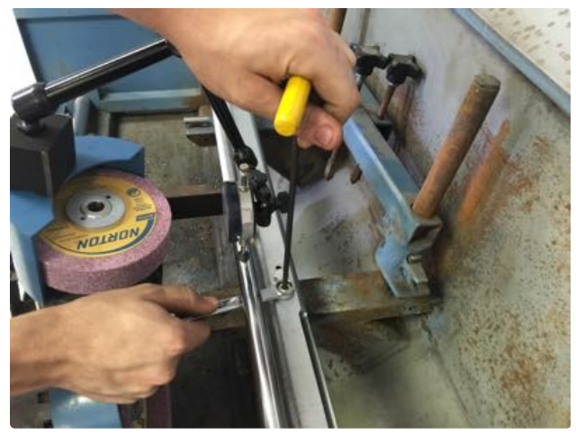
25. Loosen jam nut then adjust the bar up or down using the set screw until it is zero. Retighten jam nut.