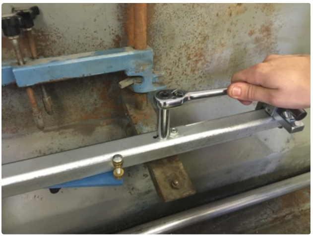
10. Replace the bar and bolt in place with the 3/8-16 x 2 bolts provided.