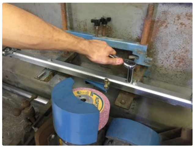
30. Unbolt and remove the bar.