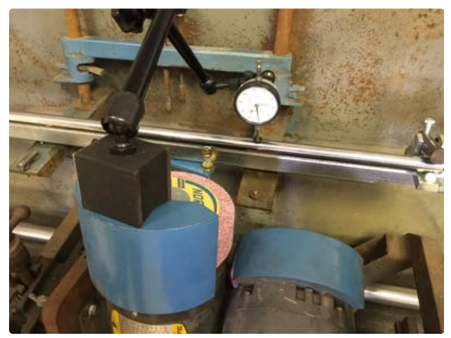
23. Pull back the dial indicator stem and move the grinding head to the right end of the roller shaft, just inside the v-support.