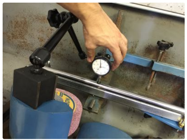
22. Set the dial indicator to zero.