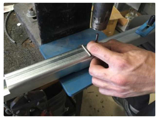
32. Press the dowel pins provided from the bottom of the bar into the .249 holes until they are flush with the top.