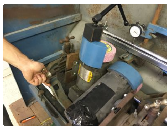
21. With the dial indicator over the main support on the left end, move the head in or out to find the high point of the shaft.