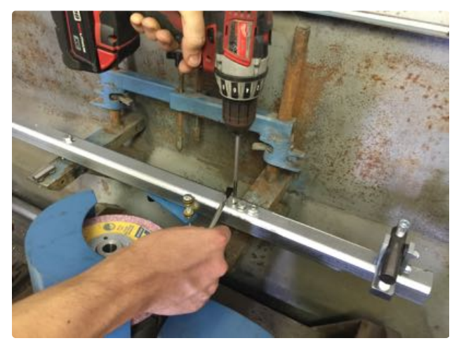
29. Ream the holes in the bar with the .249 reamer.