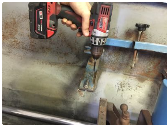
31. Ream the holes in the bed knife support with the .251 reamer.