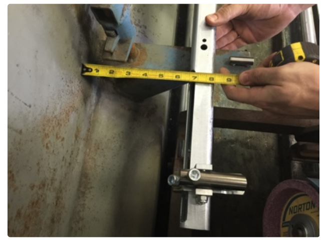
3. Position the bar so that is is 6-1/2 inches from the back wall of the grinder.