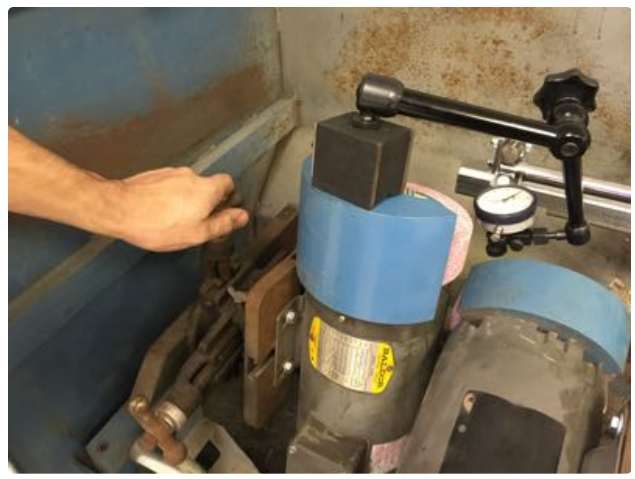
13. With the dial indicator just inside the v-support on one end, move the head up or down to find the high point of the shaft.