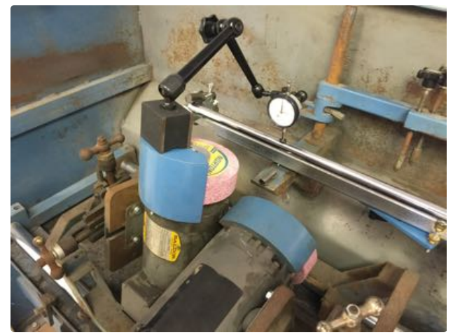
26. Move the grinding head back to the first end and repeat steps 22 through 25 until the difference is less than .003.