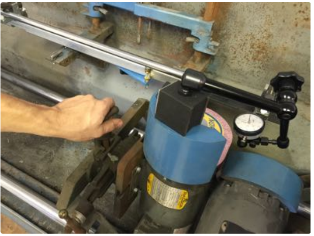
16. Again move the head up or down to find the high point of the shaft.