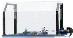
77580-01 Full Shield

79093-05 Ceramic Relief Stone will grind relief in half the time as a standard aluminum oxide stone.